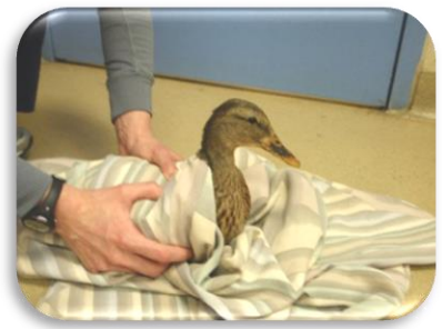
Here the sheet has been pulled back for illustrative purposes