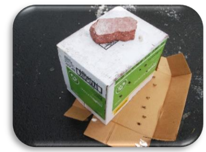
Cover the bird with the inverted box and slide cardboard under the box