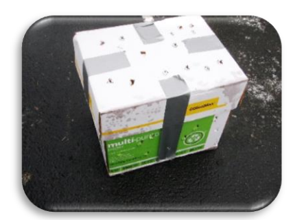
Tape the cardboard panel to the box to fully contain the bird for transport