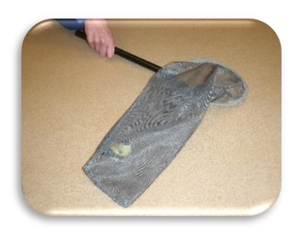
Step 1: place the net over the bird