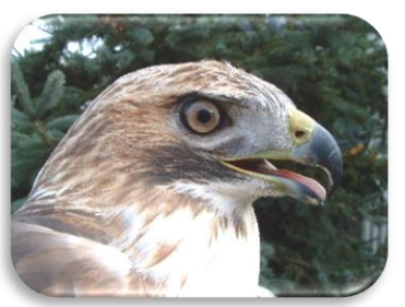
A Red-tailed Hawk

• For any bird that has sharp talons (e.g. a hawk or owl) you should wear thick leather gloves, ideally, welding-type gloves with gauntlets that protect your forearms. However, these birds may still be able to penetrate the gloves with their talons, so