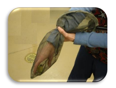
Step 3: reach in and gently grasp the bird