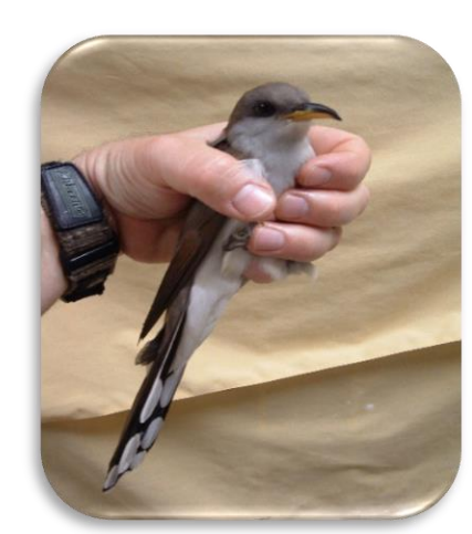
Demonstrating proper restraint of songbirds. Wear vinyl or nitrile exam gloves if available. Wash your hands after handling a bird.