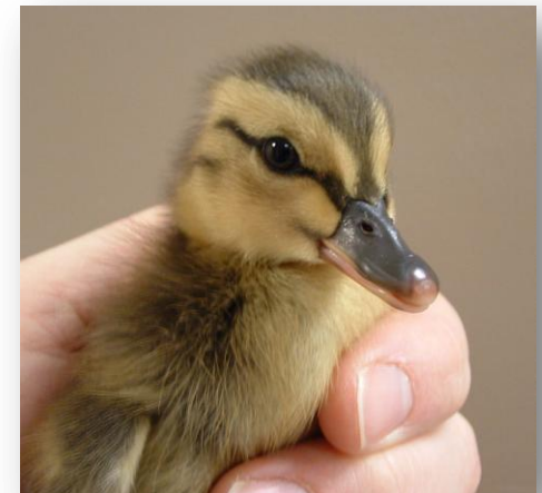
This Mallard duckling is highly dependent on its mother for protection. A downy duckling or gosling, if found alone, almost certainly needs help.