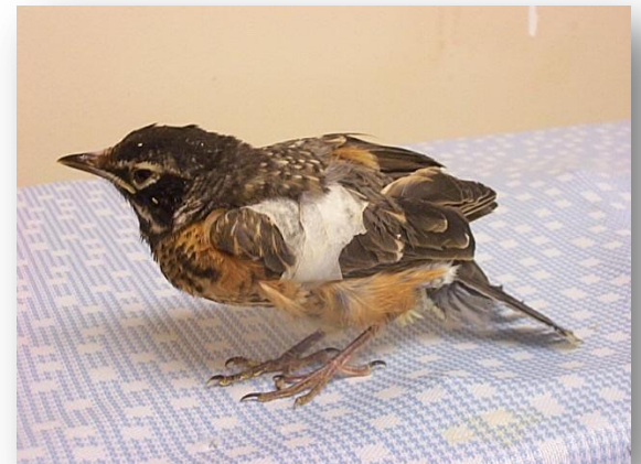
We stabilized this juvenile American Robin's fractured wing so it would heal properly