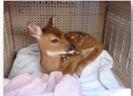
This fawn was brought to us by someone who found it alone and assumed it was orphaned. We returned the fawn to the location it was found to reunite with its mother

See below for information about how you may safely and effectively warm a baby animal.