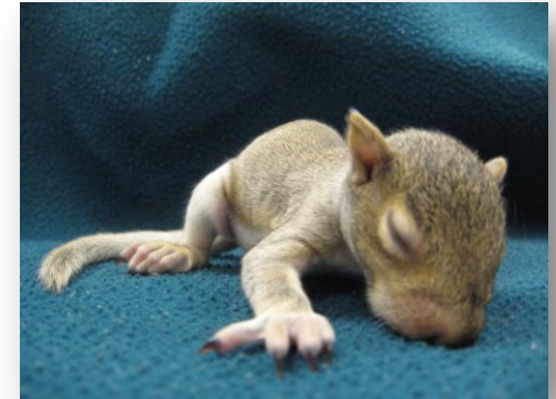
A nestling Gray Squirrel: too young to be out of its nest

Once they are fully-furred and their eyes are open, it is not unusual for juvenile squirrels to come out to play near their nest and practice climbing up and down a tree when their mother is away looking for food. But squirrels whose eyes have not yet opened or whose bodies are not yet fully covered in fur should NOT be out of the nest. For more information about what to do when you find a baby squirrel, please see this pdf on our web site: http://www.wihumane.org/wildlife/documents/BabySquirrels.pdf