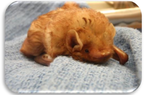
This little cutie is an Eastern Red Bat. Despite the negative stereotypes, bats are very beneficial due to the vast number of insects they eat.