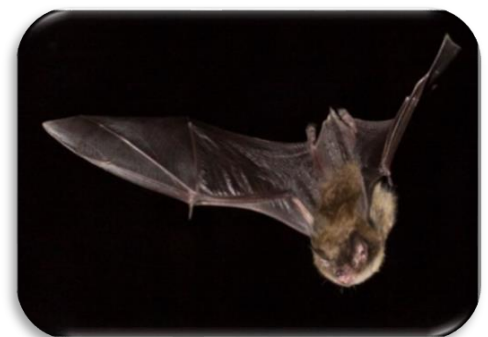
Bats must be nimble and aerobatic fliers to catch their dinner of insects in flight.