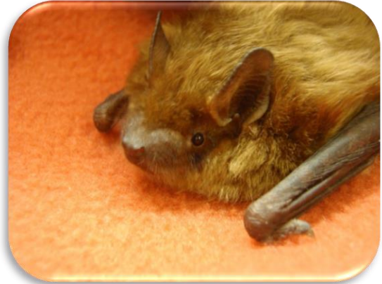
This is a Big Brown Bat. Despite the "big" in their name, they are surprisingly small (and adorable!).

may be injured or sick, or it may just be a migrating bat that has stopped to rest. If a bat is found outside on the ground , it is probably injured, sick, or exhausted. And a mother bat that becomes grounded may be unable to take flight because she is carrying her "pups" (babies) -- in our area this is a possibility for mother Eastern Red Bats, Hoary Bats, and Silver-haired Bats.