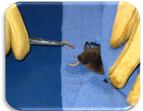
Here we're hand-feeding mealworms to a Big Brown Bat in care at our wildlife hospital.

There is concern among bat conservationists that the novel coronavirus that causes COVID-19 in humans could accidentally be passed by humans to Wisconsin's bats, with devastating results for bat populations. Thus, the Wisconsin Department of Natural Resources, who regulates all wildlife rehabilitators, has temporarily banned bat rehabilitation in Wisconsin . As a result, sadly, we are only permitted to admit bats for humane euthanasia, such as when a bat must be presented for rabies testing or is severely injured.